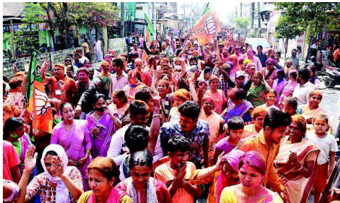
Jubilant BJP supporters taking out a rally to celebrate the party's victory in the municipal elections, in Nalbari on Wednesday. - UB Photos

NEW DELHI, March 9: Prime Minister Narendra Modi today hailed the BJP's landslide victory in municipal board polls in Assam, saying this shows the people's faith in the party's development agenda. "Gratitude to the people of Assam for blessing BJP and our allies in the recently concluded municipal elections," Modi tweeted. - PTI