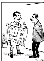
I wish there was a corruption locating device.